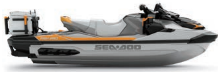
NEW Shark Grey & Orange Crush